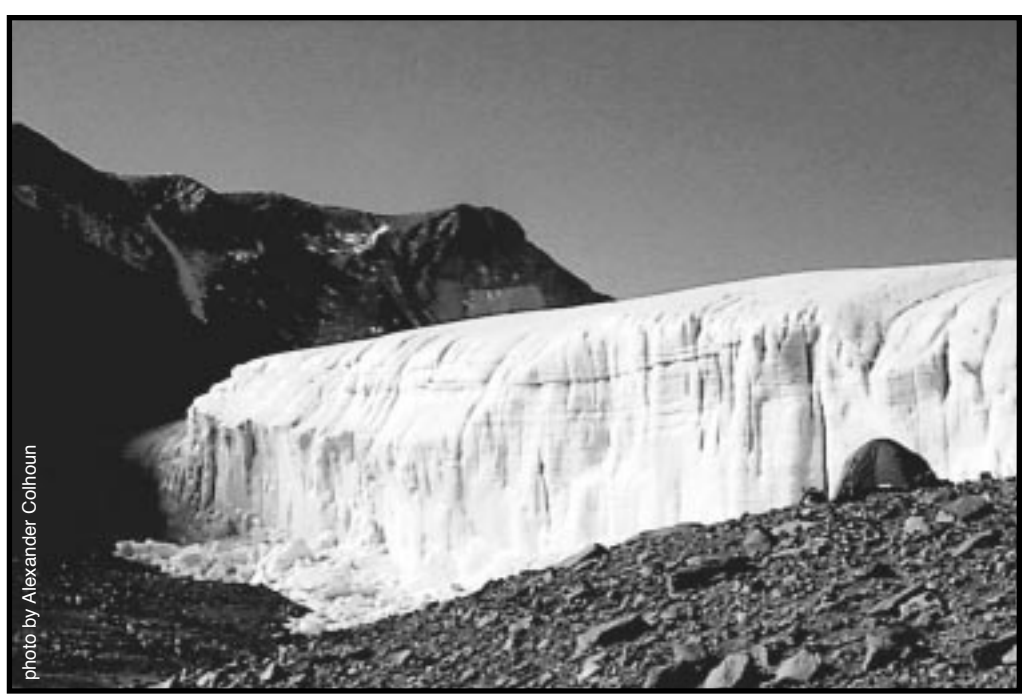
Warm temperatures last week did little to melt the Canada Glacier in the Taylor Valley, but clear skies did make for postcard views