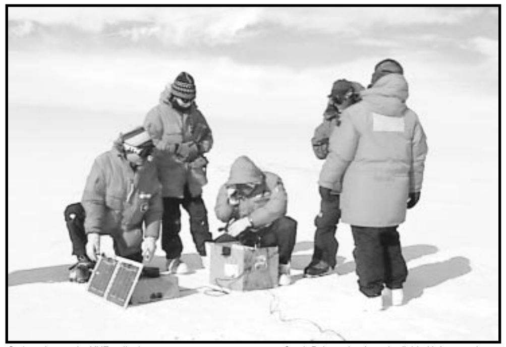
Gathered around a VHF radio, happy campers attempt to contact South Pole station from the field. Unfortunately, a solar flare over the pole obstructed radio communications

"South Pole. South Pole. This is Field Safety Training on frequency 4.770,