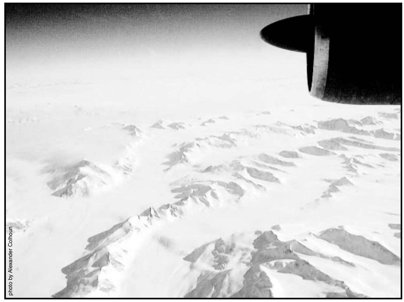
Views of the Transantarctic Mountains from the window of a C-140 more than make up for the cramped ride to McMurdo.

Detailed schedules are available outside the TV station in B-155.