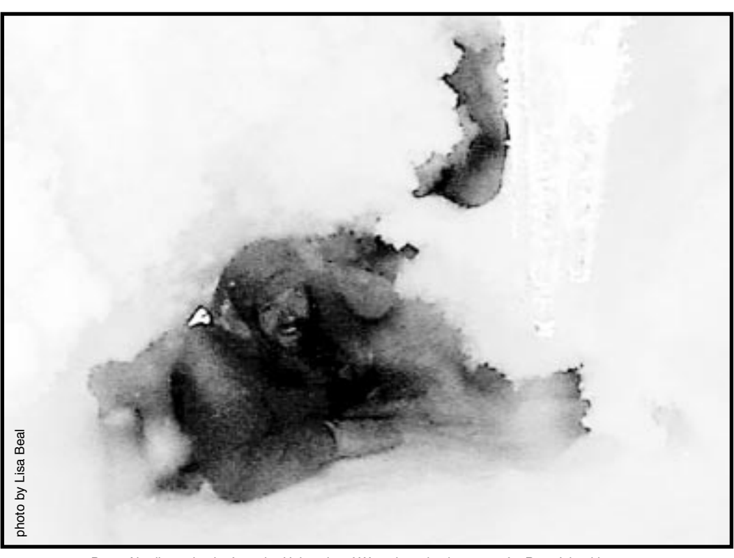
Bruno Nardi, a scientist from the University of Wyoming, clambers out of a Ross Island ice cave.

It was in the first cave that I had my moment. I had been lying on my back, taking notes, looking up into the crystals and into that blue that still amazes me –blue so blue it is as if your eyes have broken and don't work. Blue so blue it is like gas that fades away into more and more intense blue-violet. The first