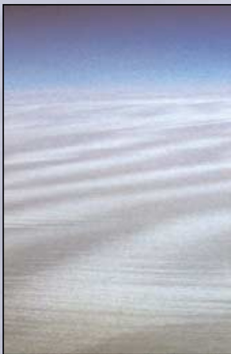
From the air, broad bands of dark and light snow are visible. These megadunes cover much of Antarctica, but are only beginning to be studied.

Instead, Scambos and Fahnestock postulated the downward flow of the katabatic wind was initially disrupted by small hills in the ice. That may have caused the katabatic wind to begin to bounce as it flowed down the plateau,