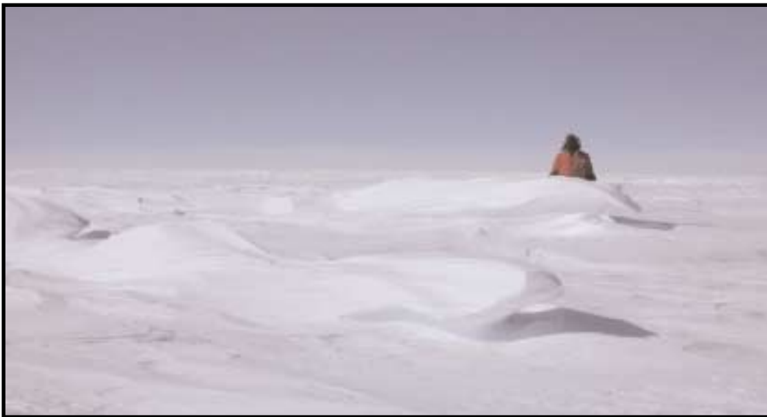
Large, wind-carved sastrugi clutter the whiter, rougher bands of snow, left, while below a glassy sheen on the downwind slopes create the darker bands.