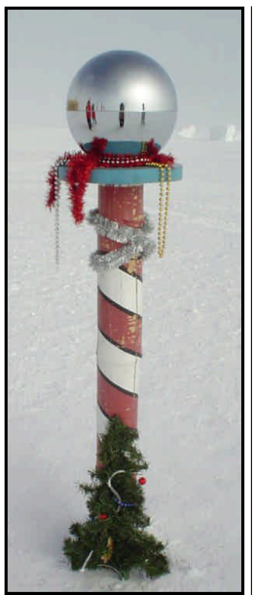
Some elves got to the ceremonial marker at the South Pole a bit early and decorated it for the holidays.