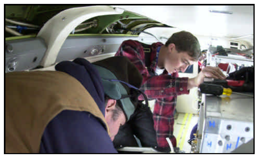
In November, mechanics fit computer equipment into the Twin Otter for the survey flights.