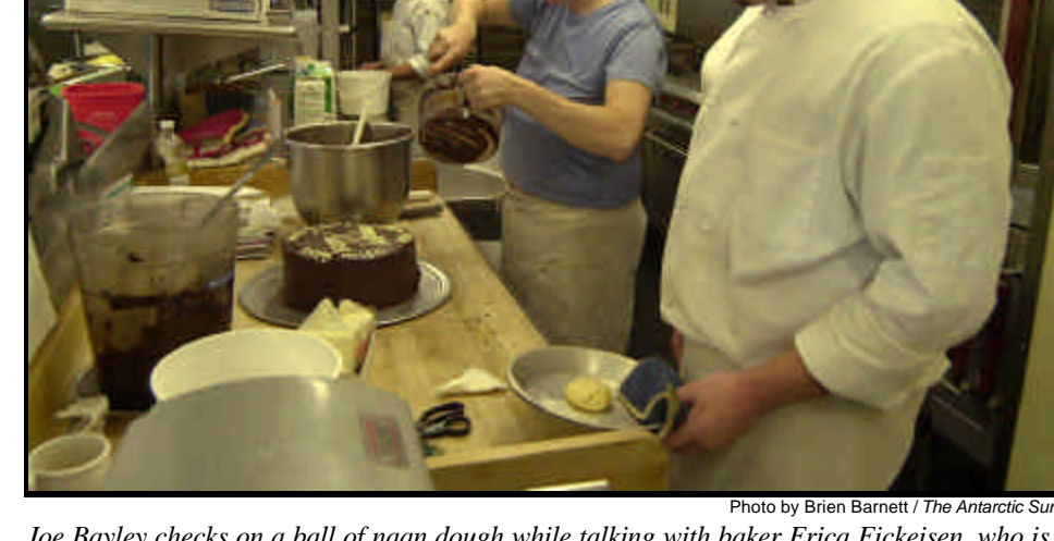
The Antarctic Sun •11