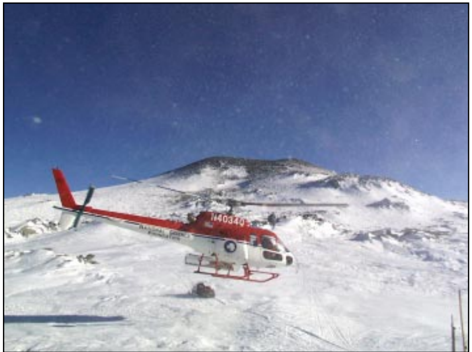
Outside of Lower Erebus Camp, an A-Star helicopter lifts off for a trip up to the caldera of Mount Erebus, 1,500 feet above.

Erebus, it's hard to forget "home" is a volcano. When the wind is right, the smell of sulfur sweeps over the camp. Even minor explosions at the rim echo miles away. And almost always, like a smoking gun, a plume of steam escapes the caldera, a reminder that the mountain is alive.