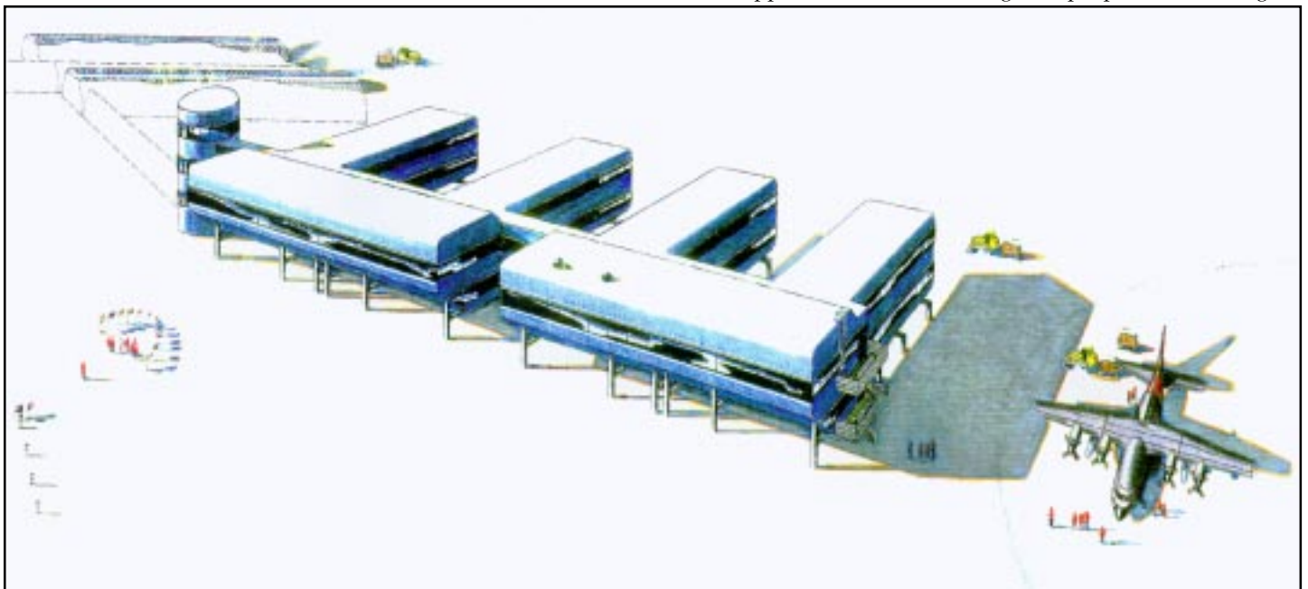
An artist's conception of the new South Pole Station. Lines in the upper left corner indicate subsurface areas. Drawing by T. Vaughan

It's the future of the $128 million South Pole Station Modernization, years in the making.