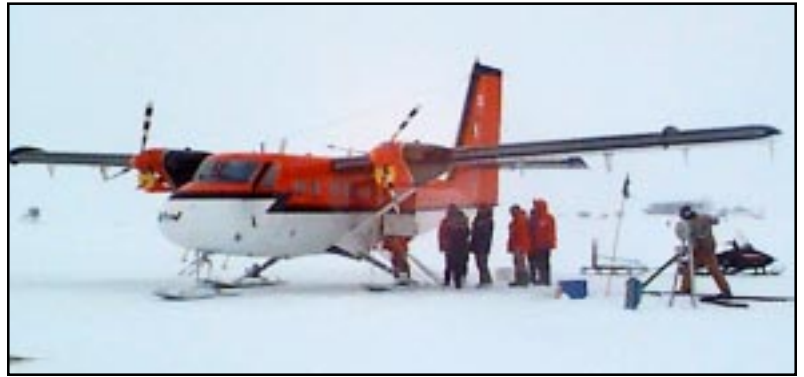
A Kenn Borek Twin Otter turboprop stops at the South Pole earlier this season.

If you have an item for the weekly calendar, e-mail us at sun_news@mcmurdo.gov, call 2407, or drop by our office in Building 155.