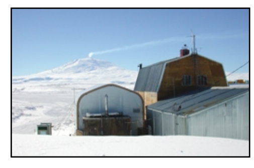
Top: Greg Guzik inspects the ATIC instrument in the long duration balloon barn at Williams Field. A massive balloon will carry it more than 120,000 feet into the sky, where it will detect cosmic rays.

Bottom: The two staging workshops for balloon projects rest in a depression in the snow at Williams Field.