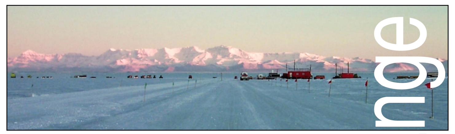
Pegasus Ice runway at Winfly.