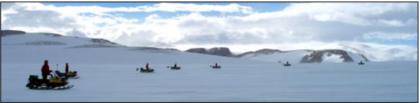
The meteorite hunters sweep an area near the Miller Range earlier this season looking for alien rocks. The eight-person team conducts

searches on snow mobiles, spread apart by about 10 meters to ensure not even the smallest meteorite is missed.