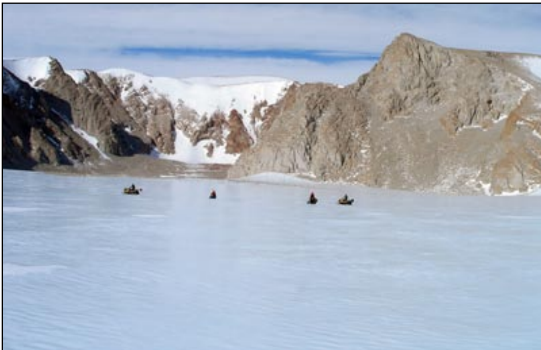
Blue ice in what the meteorite hunters call the Hockey Cirque near the Miller Range makes it relatively easy to spot a meteorite.

"These are samples of the great unknown," Harvey said.