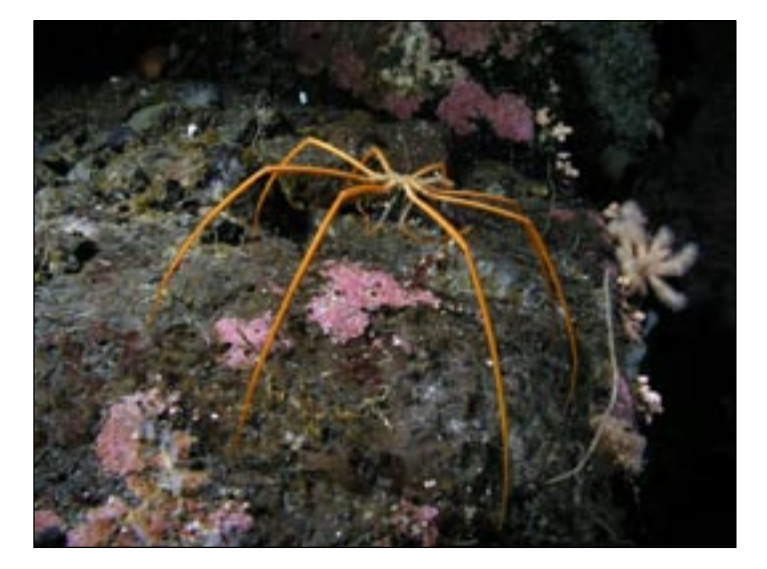
There are 101 species of sea spiders that are endemic to Antarctica, an organism that exclusively lives on the seafloor bottom.