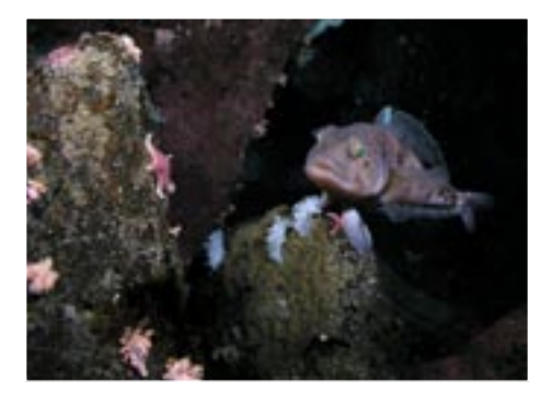
A Trematomus bernacchii, or Bernac for short, is spotted among seafloor rocks, which are also home to nudibranch and sea stars.

Of course, there are far more species of animals in McMurdo Sound than just forams and nudibranchs. Bowser says he sees Antarctic scallops and sea spiders everywhere on the silty sand bottom of Explorers Cove. Sea stars and sea urchins dominate where Moran and Woods have been diving on the other side of the sound. Fish, sponges, anemones and other soft corals also abound in the shallow depths